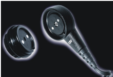
... MagCode PowerSystem (Max. current load up to 15A, magnetic locking only)