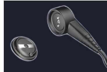
... MagCode PowerSystemPro (Max. current load up to 25A, with mechanical bayonet lock)